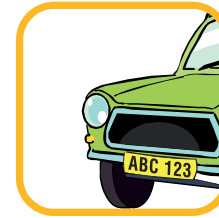
Signage & Logos